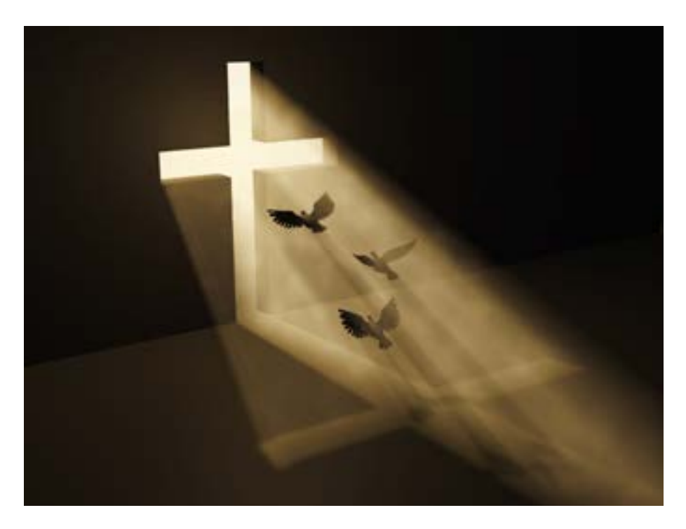
Sunday, March 24. 2019 - Lent III