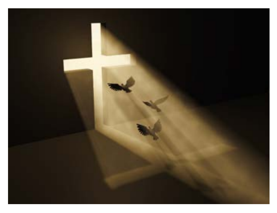
Sunday, March 17, 2019 - Lent II